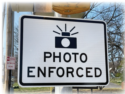
Photo enforcement of the school zone speed limit and other areas impacted by speeding vehicles addresses this problem on Tukwila streets and improves safety for everyone. Tukwila officers respond every year to multiple avoidable collisions caused by speeding in our city. Pedestrian safety is a priority. A pedestrian hit at 20 MPH has a 90% chance of survival, dropping to 50% at 30 MPH, and a 10% survival rate at 40 MPH.

This year, an additional camera was installed in the vicinity of Codiga Park for full-time speed enforcement. This stretch of 50th Place South has routinely seen speed-related issues. Vehicles that gather speed coming down the hill from Skyway oftentimes do not slow to a safe speed before entering the residential area of Allentown.